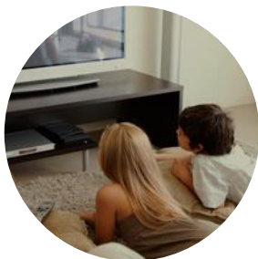
Television addicts 10m